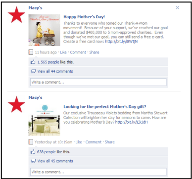
Likes on a Facebook Page

Search engines analyze the link graph – the number and quality of links to a given page – in order to determine the authority of that page. When your Facebook page gets “Likes” from Facebook users , you will accumulate links from public user profiles that are visible to spiders. You should also have a regular stream of posts so that your page constantly appears in newsfeeds for these users. Also, you should design your content to drive social engagement as this will greatly help boost your authority and therefore how well your Facebook page ranks.