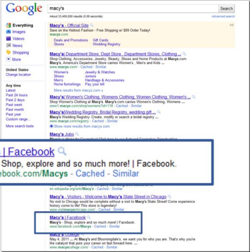
Example of Facebook page in search results on a brand term

Third, it drives engagement on your social media sites. The higher on the list your Facebook page appears, the greater the chance that customers will go to that page and engage in conversations with you, "Like" your page or "Share" an item for sale. And the more customers "Like", "Share", and otherwise engage on your Facebook page, the higher your search rankings are likely to be.