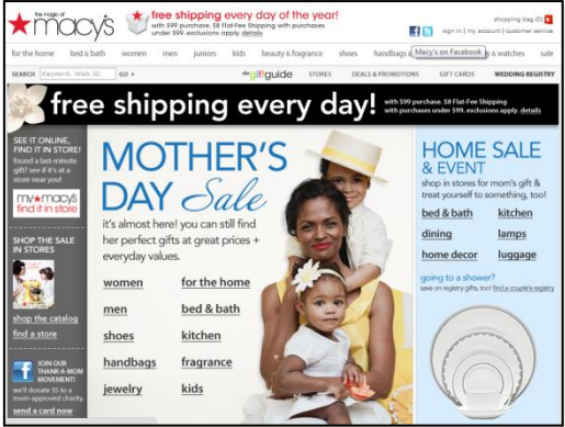
Link to Facebook from Home Page (with brand in alt-text)

Adding links from your website to your Facebook page signal to search engines that your Facebook page is highly relevant for your brand. We recommend you link to your Facebook page from at least your website home page but if possible from as many other pages as possible on your site (e.g., through your footer or standard template). When you do so, make sure the anchor text includes your brand (e.g., "Macys on Facebook") in the text link or define an alt-text image tag with this text in an image link. And also make sure you link to the canonical (short) URL i.e. facebook.com/macys NOT facebook.com/Macys?sk=app_12796642393487