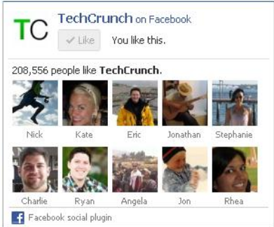
A “Fan Box” on a Website drives social engagement back to your Facebook page

Finally, if you are advertising on Facebook, you should promote “Like” sponsored stories for your Facebook page . This is another simple way to drive social engagement and Likes back to your main Facebook page to help boost its rank.