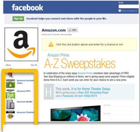
Directory pages on Facebook