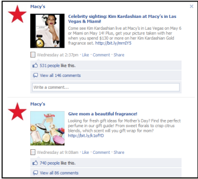
Brand Names Used in Posts

Search engines will analyze the content on your Facebook page to determine for which search terms and phrases this page should be displayed in the search results. In order to increase the relevance of your Facebook page on searches for your brand, you should frequently use your brand name in your posts (usually this happens naturally). It is best if your Facebook page name is an exact match for your brand: if you have not claimed your page vanity name, make sure that when you do, it matches your brand or, if not possible to match your brand exactly, that your vanity name includes the most common search term used on the Internet to look for your brand.